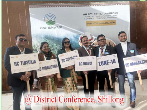
@ District Conference, Shillong