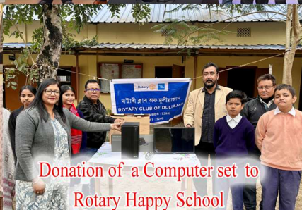
Donation of a Computer set to Rotary Happy School