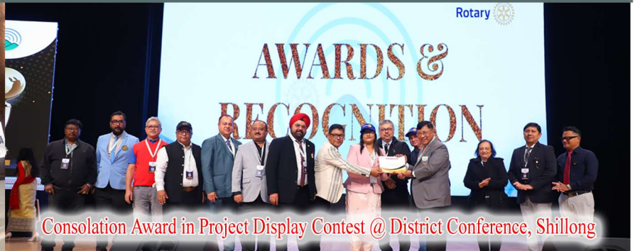
Consolation Award in Project Display Contest @ District Conference, Shillong