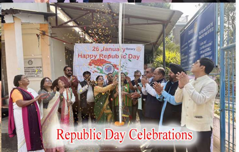
Republic Day Celebrations